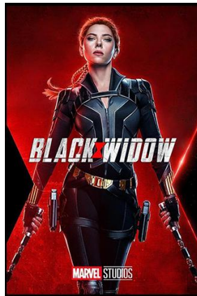
VES Bay Area Screening 07/10/21

We determined that the ONLY way to answer most of the questions was to just do it and hold our breath. We returned to the Delancey Street Screening room on the Embarcadero in the heart of San Francisco's Ball Park District. We sent out the eblasts, gathered the RSVPs. Then we confirmed with the venue to check their ventilation systems, their air filters and their overall compliance with public health guidelines. And then we waited. On the night of the screening, when we opened the gates, members came. They brought their families, they brought their masks, they brought their CDC vaccination cards, but the thing they brought the most of was their support and gratitude. The evening was a win all the way around because not only did we learn that we were the last org to screen at Delancey in 2020 but we were also the first to return in 2021. For the first time in 16 months we were able to remind people that the craft they have dedicated their lives to can still be enjoyed the way it was always meant to be, and that is on the big screen. While our initial efforts have been slowed by the pervasiveness of the Delta variant we have another screening lined up for the second week in September and will have more to report.