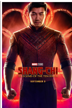
VES Bay Area Screening 09/10/21