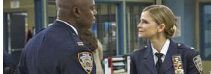
Exclusive video: Emmy champ Kyra Sedgwick dishes guest stint on 'Brooklyn Nine-Nine'