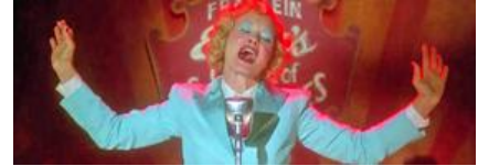
Exclusive video: Jessica Lange: What I'll miss most about 'American Horror Story'