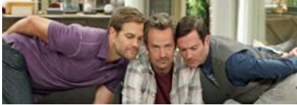
Exclusive video: Matthew Perry on 'dream-come-true' role as Oscar Madison on 'The Odd Couple'.