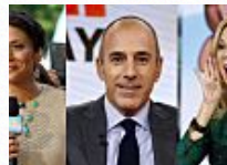
The Most and Least Liked Morning TV Hosts -- From Robin Roberts to Kathie Lee