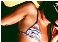
Kendall Jenner Posts a Highly-Inappropriate Bikini Pic of Herself (PHOTO) (Stirring Daily)