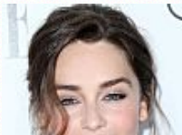
'Terminator' Reboot Casts 'Game of Thrones' Star Emilia Clarke as Sarah Connor -