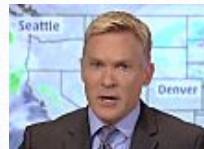
Sam Champion on Josh Elliott's ABC Departure: 'I Know That Fans of 'GMA' Are