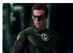
'Lantern' Writers Working on Sequel, 'The Flash' - TheWrap