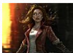
'Avengers: Age of Ultron' First Look: What Joss Whedon Plans for Quicksilver, Scarlet