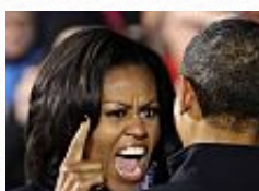
The Queen Of Mean: 15 Times Michelle Obama Was A Very Angry First Lady -- Tantrums, (Radar Online)