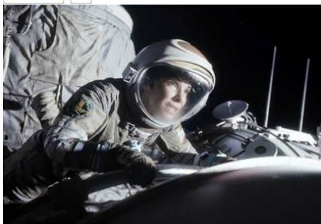
Sandra Bullock in "Gravity"