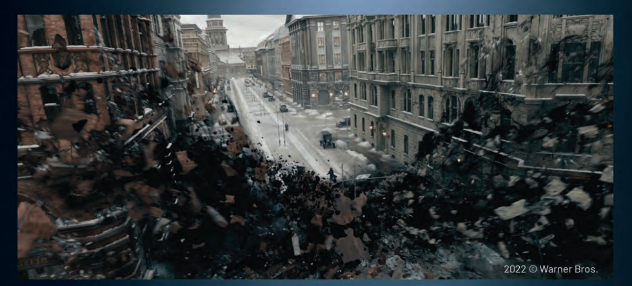
IMAGE ENGINE Outstanding VFX in a Photoreal Feature Outstanding Effects simulations in a Photoreal Feature 21st Annual Visual Effects Society Awards

TO ALL OUR ARTISTS, CLIENTS & FRIENDS ON THEIR NOMINATIONS THIS AWARDS SEASON